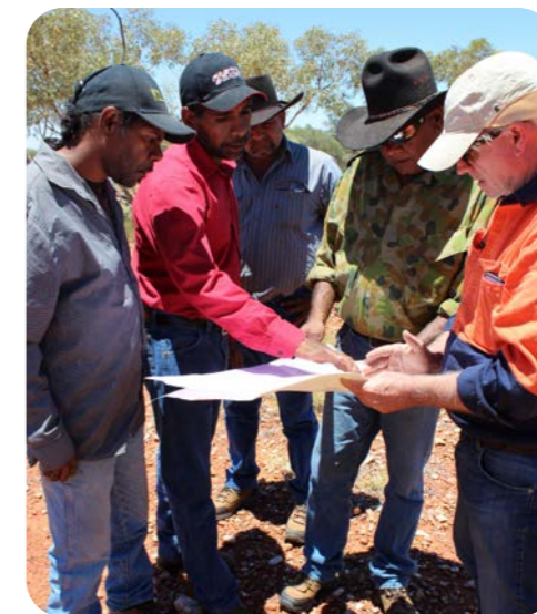
Above: Traditional owners working with Jemena on the NGP.

Opportunities – Building on these relationships and respect, we will seek to find the opportunities to work together with Aboriginal and Torres Strait Islander peoples, communities and businesses.