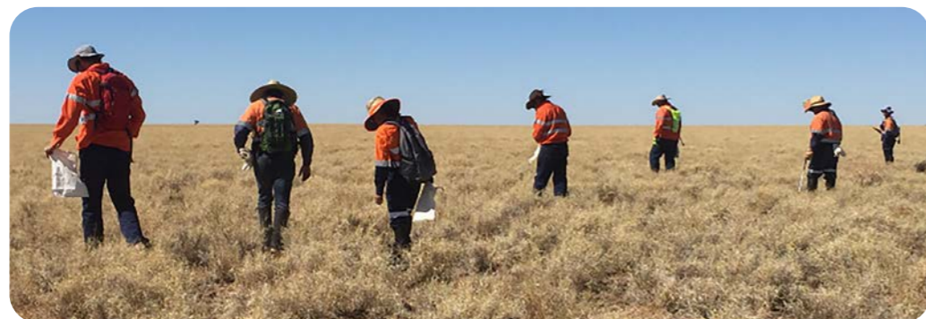
Above: Cultural Heritage survey activities along the NGP being undertaken by Traditional Owners.