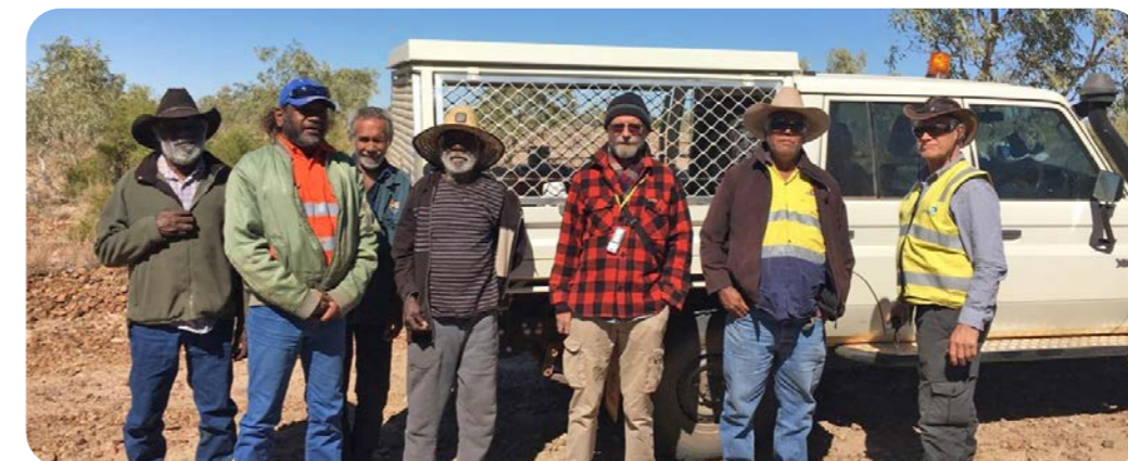
Above: Traditional Owners on site during construction of the NGP.